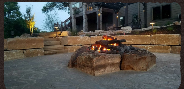
Sandstone Moss Boulders

Weathered sandstone with moss and lichen.