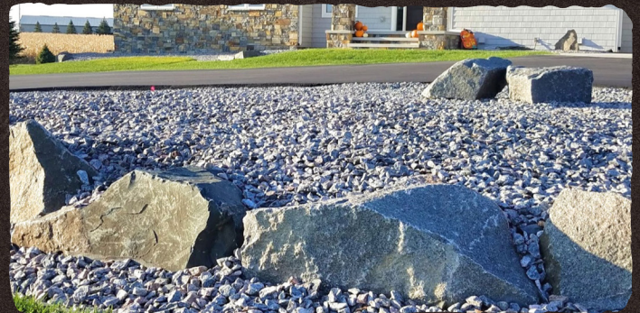
Gun Smoke Gray

Gray quarried stone with some flat edges for walls and outcropping. NOTE: Decorative Size Available