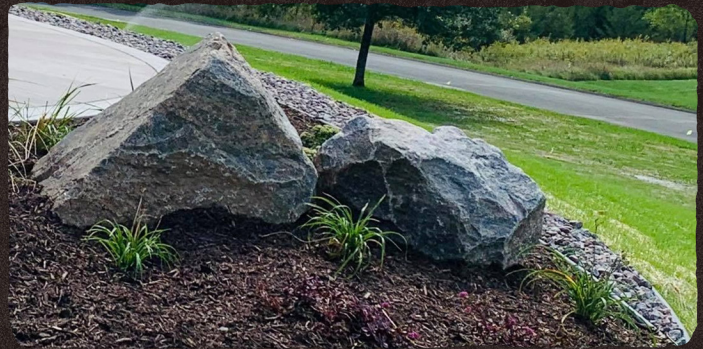
A shimmering rock excellent for accenting. NOTE: Decorative Size Available