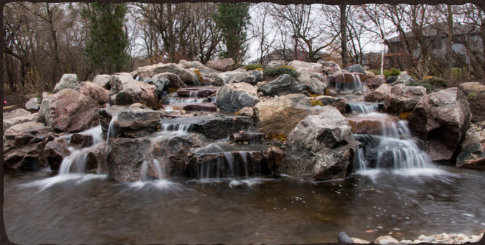
Dark gray granite with streaks of pink gneiss. NOTE: Decorative Size Available