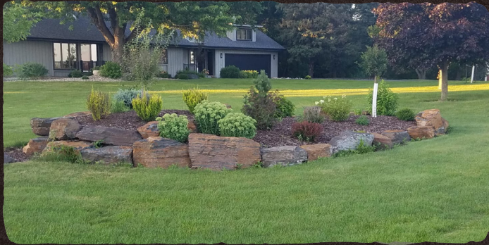
Cedar Valley Auburn

A very dark rock with blends of cedar coloring mixed in.